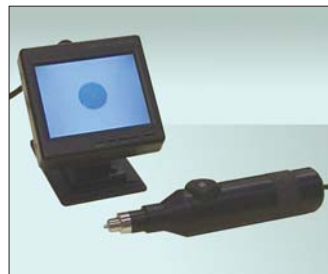
Viewer for inspection of fibre optic end face

If an unexpectedly high insertion loss is encountered in general use which results in the system not operating, then all fibre optic contact end faces should be cleaned as described overleaf.