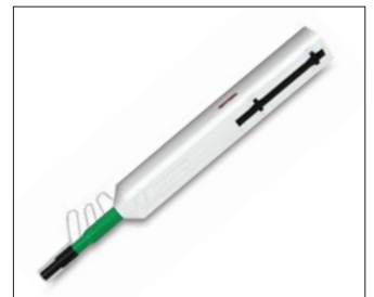
"One Click" cleaner for fast emergency cleaning